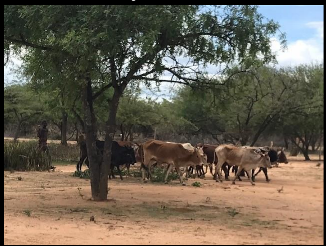
Pastoralism – migration - conflicts